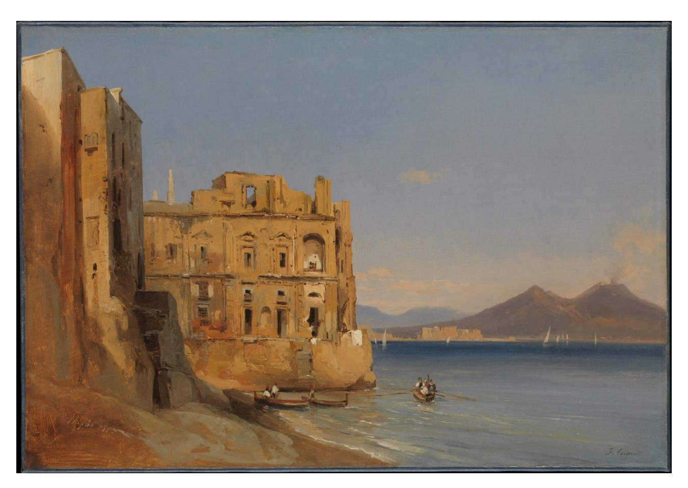
Jules Coignet, Palazzo Donn'Anna, 1843

Abstracts proposals (max 2500 characters including spaces) and a short biographical profile of the author (max 500 characters including spaces) may be sent by July, 20 2023, to the following email address: viaggi.architetto@gmail.com.